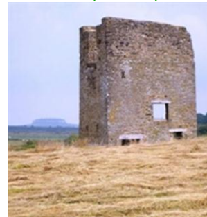
A walk at a relaxed pace, through wild country, with fairly gentle climbs.