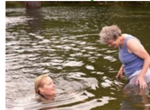
NEW for this year - a walk and optional Wild Swim!