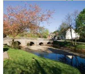
This 9 mile walk follows a route into valleys near Llanfair Waterdine.