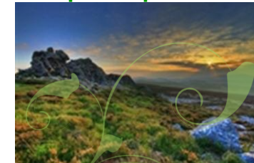
This single walk includes the 2nd highest point in Shropshire.