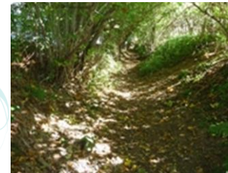
An old favourite as requested by guests.