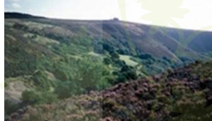
Perkins Beach to Golden Valley