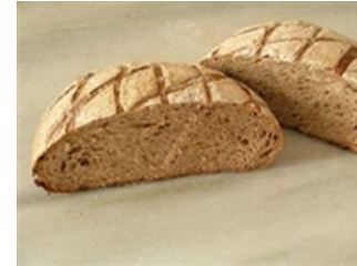
A walk from Bishop's Castle to visit the water-powered flour mill at Bachelldre.